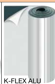
K-FLEX AL CLAD